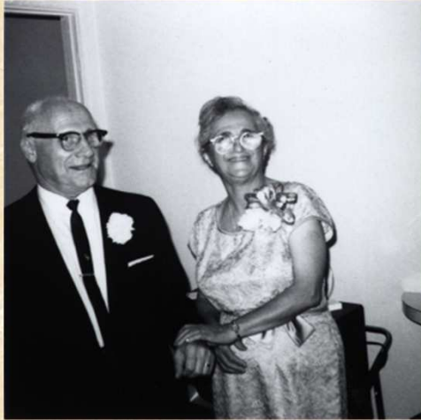
Celebrating their 50 th wedding anniversary