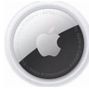
Apple AirTag tracker