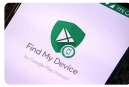
Google “Find My Device”