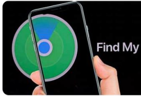
Apple “Find My”