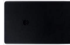
Pebblebee card tracker

Some months ago, I had a pleasant picnic lunch with a cousin in a local park. When we got up to leave, I inadvertently left my iPhone on the picnic table or bench. A half-hour later, I realized that I did not have my phone and raced back to the park. However, it was gone.